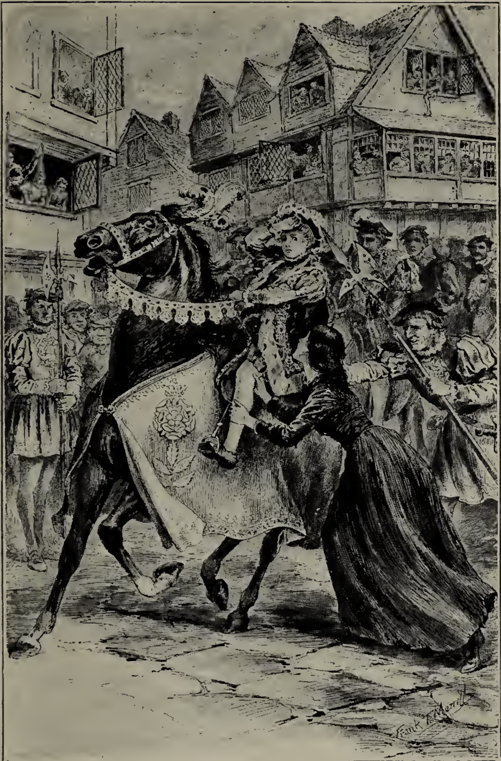
“OH, MY CHILD!”